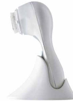
For proper charging place handle in the charger as shown

Compatible with 120 Volts AC/60 Hz outlets.