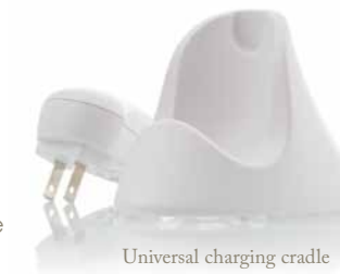
Universal charging cradle