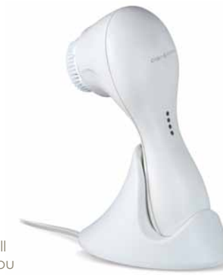
For proper charging place handle in the charging cradle as shown

If the shape of the plug does not fit the power outlet, use an attachment plug adapter of the proper configuration for the power outlet.