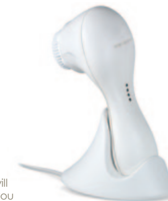
For proper charging place handle in the charging cradle as shown

If the shape of the plug does not fit the power outlet, use an attachment plug adapter of the proper configuration for the power outlet.