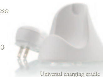
Universal charging cradle